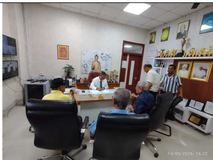
MoU Signing Ceremony between DSCSITSC and People's Association for Science and Environment on 14/05/2026 organized by BSH Dept.