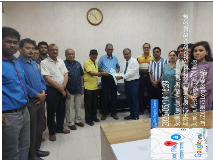
MoU Signing Ceremony between DSCSITSC and People's Association for Science and Environment on 14/05/2026 organized by BSH Dept.